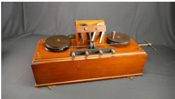
Marconi Magnetic Detector